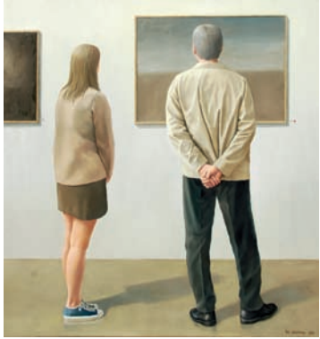
"Viewing the masterpiece", oil on canvas, 98x92 cm