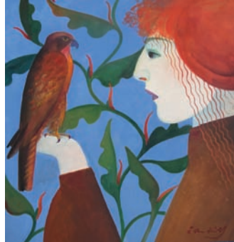
"Farewell", gouache on paper, 28x28 cm