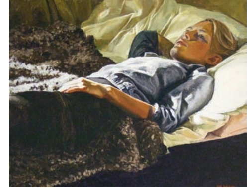
"The memory", acrylic on wood, 80x100 cm

"Someone recently said to me that my paintings looked 'secret'. It was for me a revelation of a secret that I was not aware of. When I look at what I've done so far, there is much in the claim, especially when I think of what has driven choice of subject and composing the image, a fascination with the inexplicable and 'secret' that constantly surrounds us in everyday life. In my pictures I also feel an absence, perhaps a loss?"