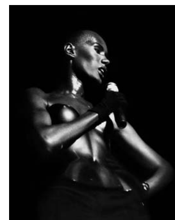
"Grace Jones", photo, 50x40 cm, 20 signed copies